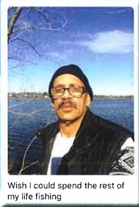
Wish I could spend the rest of my life fishing