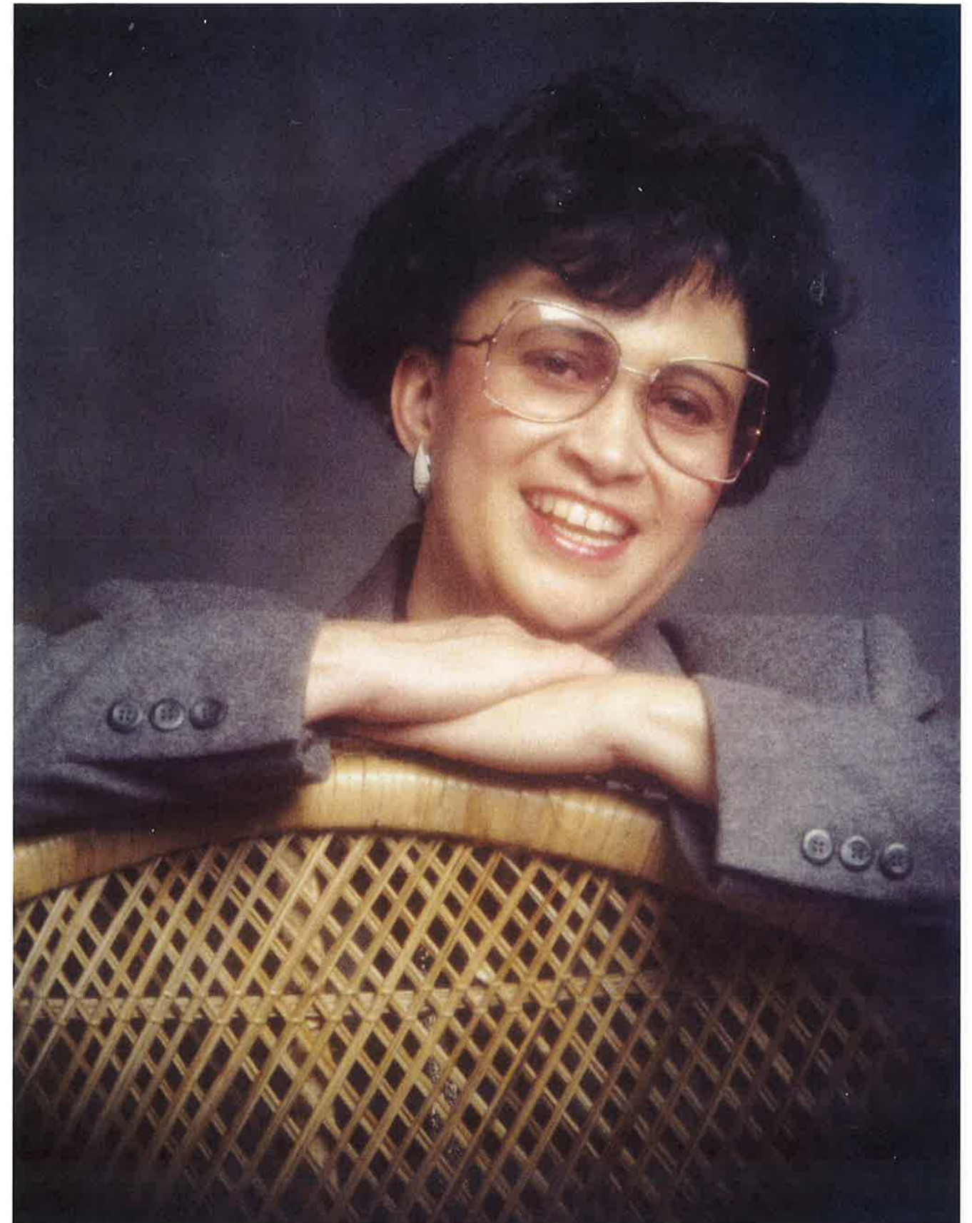
SUNRISE October 31, 1940