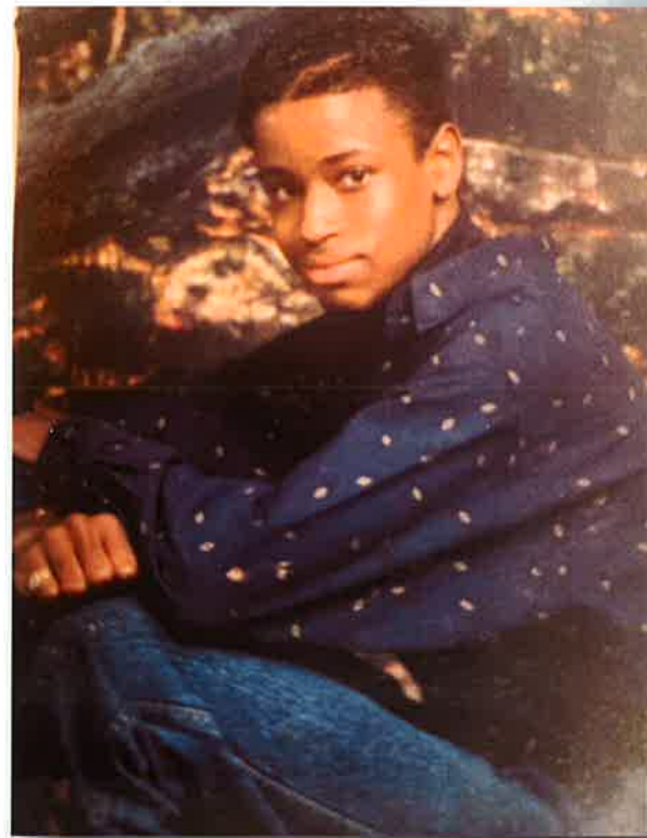
the "growing son"