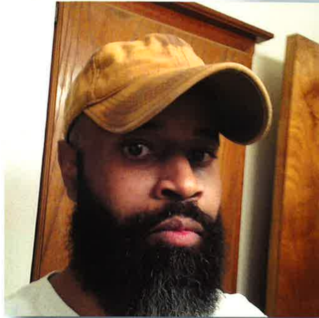
the "famous beard"