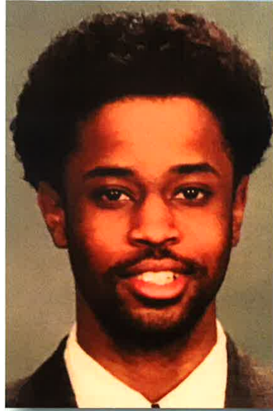
the "young man"