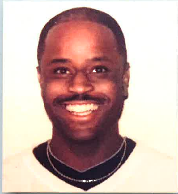
"handsome smile, contagious laugh"