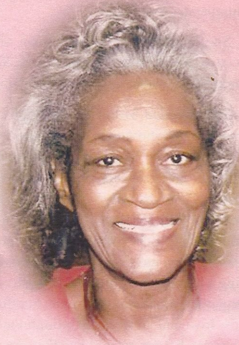
Sunset June 16, 2014